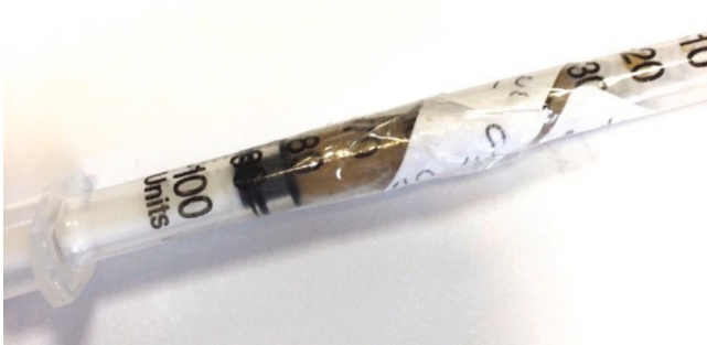
FIGURE 2: An insulin syringe containing aspirated fluid from the U-shaped structure.

Imaging (MRI) scan to better characterize this unusual structure. MRI showed a large tortuous cystic lesion on the left side of the pelvic cavity, posterior and superior to the urinary bladder, extending to the seminal vesicle, and suggestive of a possible seminal vesicle cyst versus a vas deferens cyst. Since the diagnosis could not be confirmed by MRI, a urologist was consulted to evaluate the hernia and the suspected seminal vesicle cyst. The urologist recommended surgical exploration of the area.