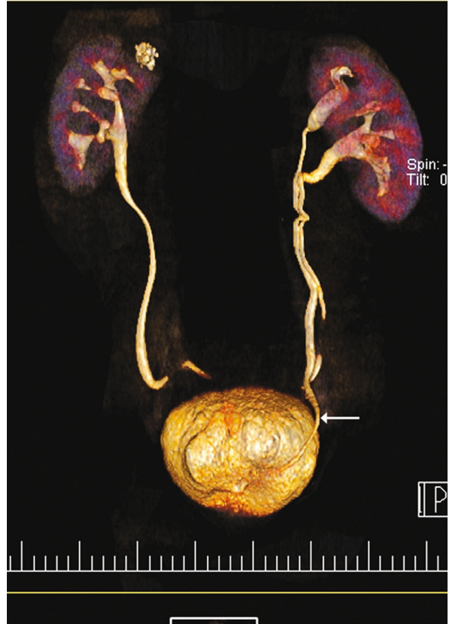
FIGURE 3: CT urogram showing duplex (i.e., with double ureters) left kidney. The left upper moiety ureter that empties into the bladder at an ectopic site is indicated by the arrow.

Imaging (MRI) scan to better characterize this unusual structure. MRI showed a large tortuous cystic lesion on the left side of the pelvic cavity, posterior and superior to the urinary bladder, extending to the seminal vesicle, and suggestive of a possible seminal vesicle cyst versus a vas deferens cyst. Since the diagnosis could not be confirmed by MRI, a urologist was consulted to evaluate the hernia and the suspected seminal vesicle cyst. The urologist recommended surgical exploration of the area.