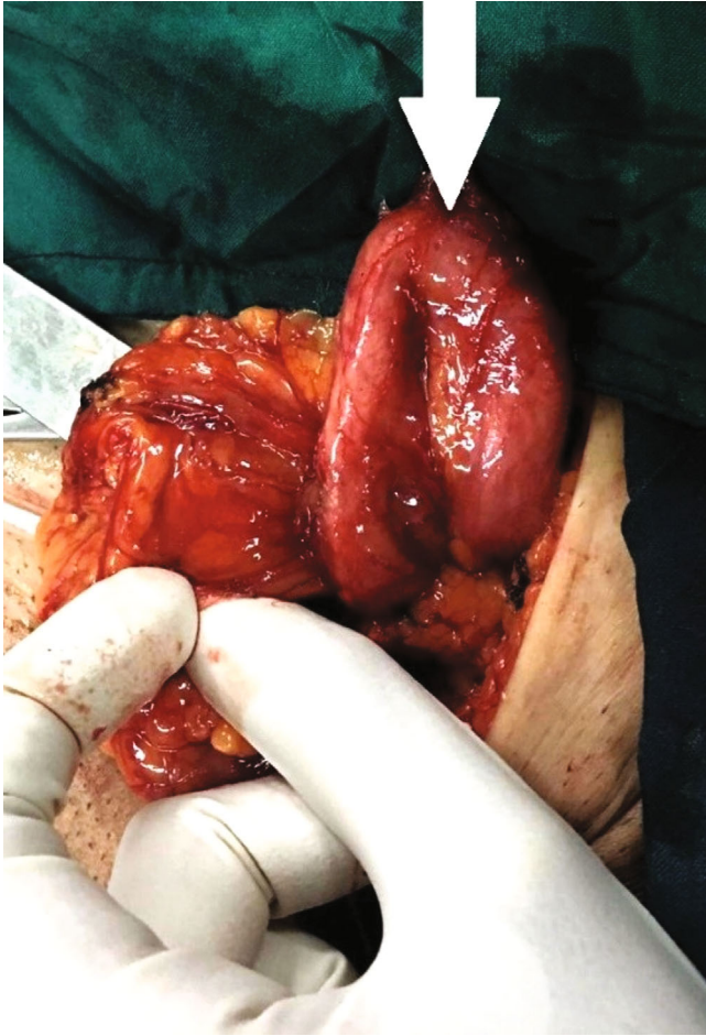
FIGURE 1: Surgical exploration shows a rare ectopic ureter (U-shaped structure) in the inguinal canal as shown by the arrow.